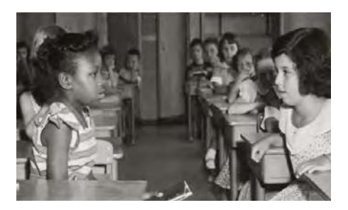
Federal court decisions ended the practice of having segregated schools for Mexican-American and African-American students.

• Endrew F. v. Douglas County School District, decided in 2017, in which public schools were required, under the Individuals with Disabilities Education Act, to provide disabled students with opportunities to make meaningful, "appropriately ambitious" progress, such as grade-level advancement.